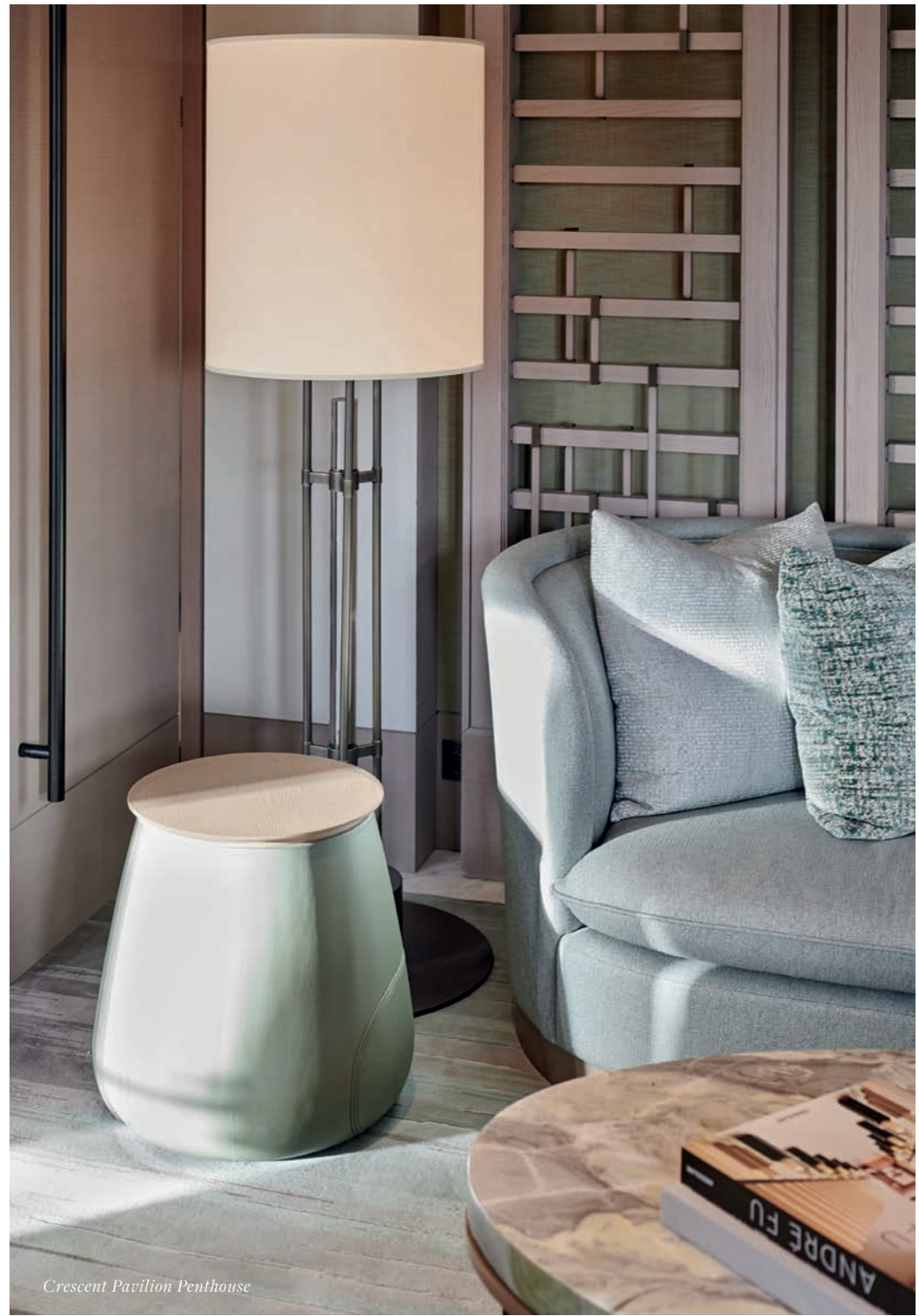
Crescent Pavilion Penthouse