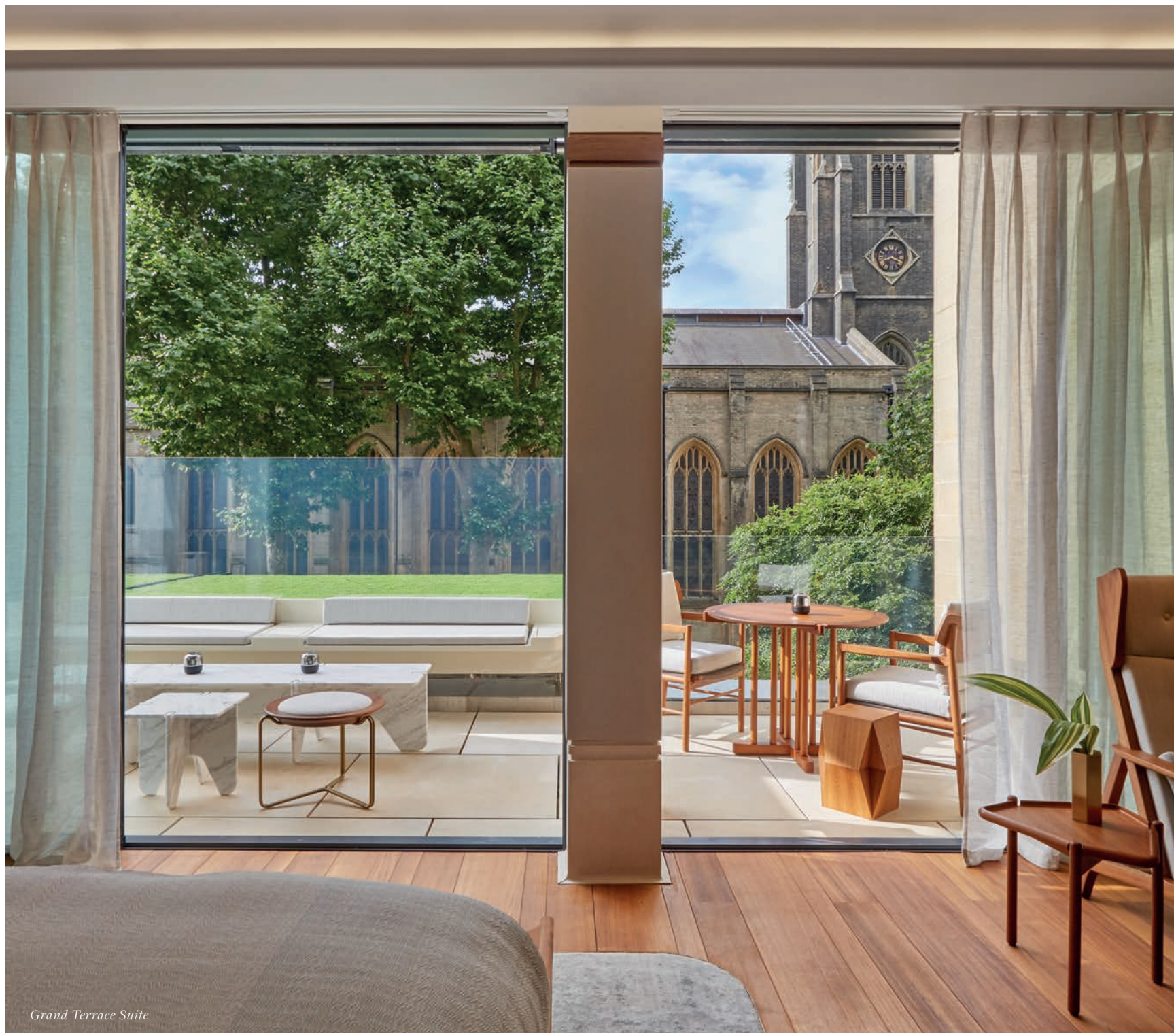
Grand Terrace Suite

Whether you're in London for a meeting of minds, to gather with the family for a special occasion, or just need space to unwind, each room and suite at The Berkeley offers a refuge from the rush of the city from the moment you arrive. Each, individually designed, is a study in urbane comfort with simple, beautiful details effortlessly combined. Handpicked furniture, luxurious fabrics, bathrooms of Italian marble and original artworks abound.