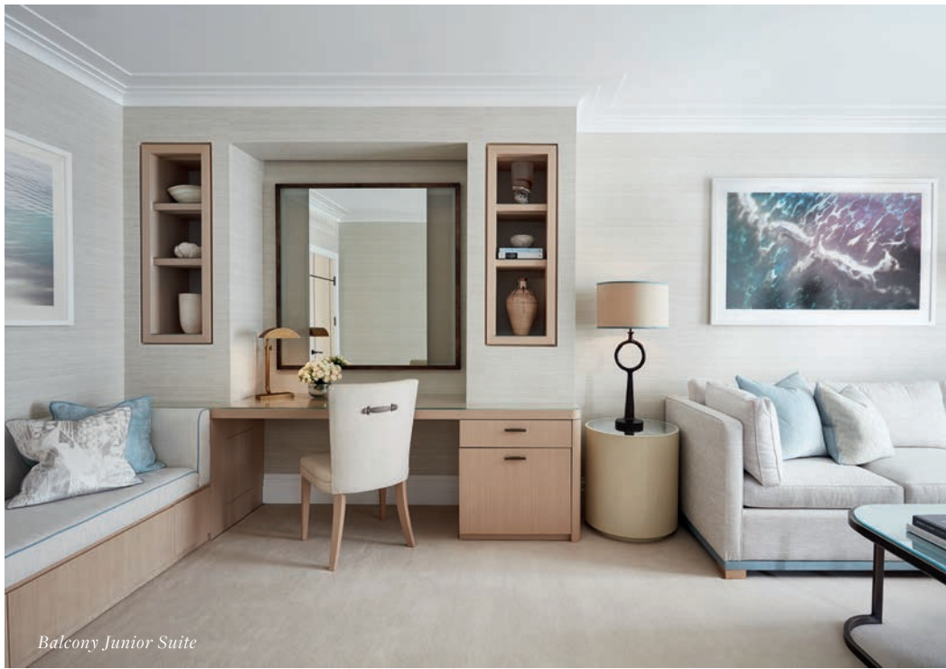
Balcony Junior Suite