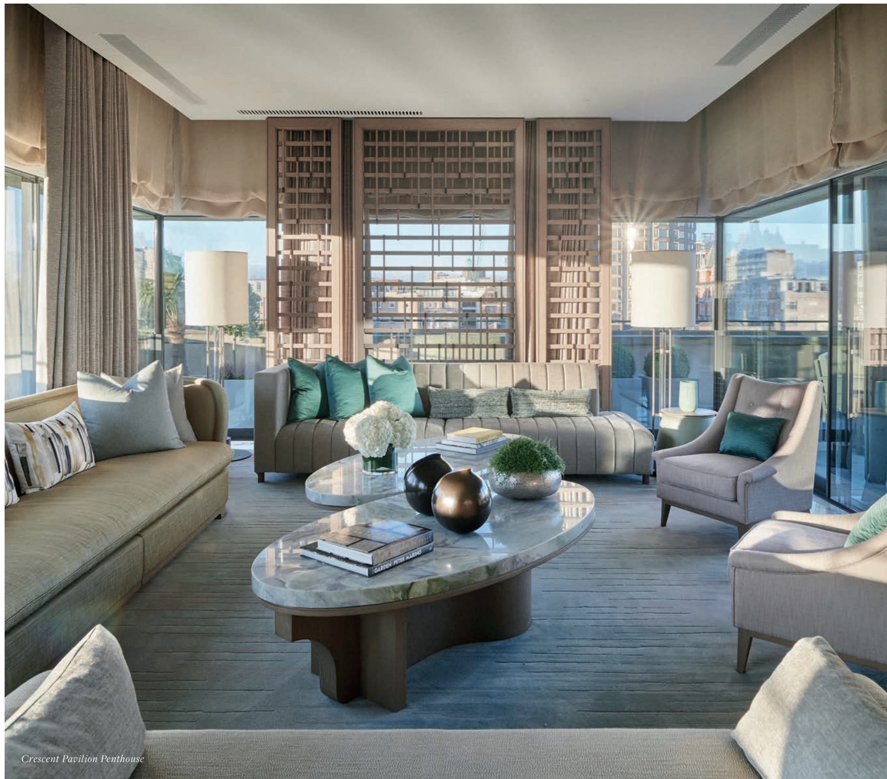
Crescent Pavilion Penthouse

The epitome of modern British luxury, suites at The Berkeley have to be seen to be believed. Created by the world's most accomplished interior designers, these are breathtaking new living spaces with room for dining, entertaining and relaxing in style. Exciting innovations include dressing rooms, kitchens, twin bathrooms, private entrances and connectability that creates whole apartments, complete with private hallway, corridor or even entrance. Alongside these wow factors are many delightful personal touches – and to complete the picture, many of the suites have spacious terraces or balconies: pockets of calm with views of the leafy streets of Belgravia and the blue skies over London.