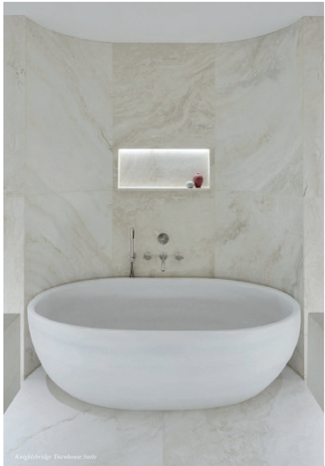
Knightsbridge Townhouse Suite