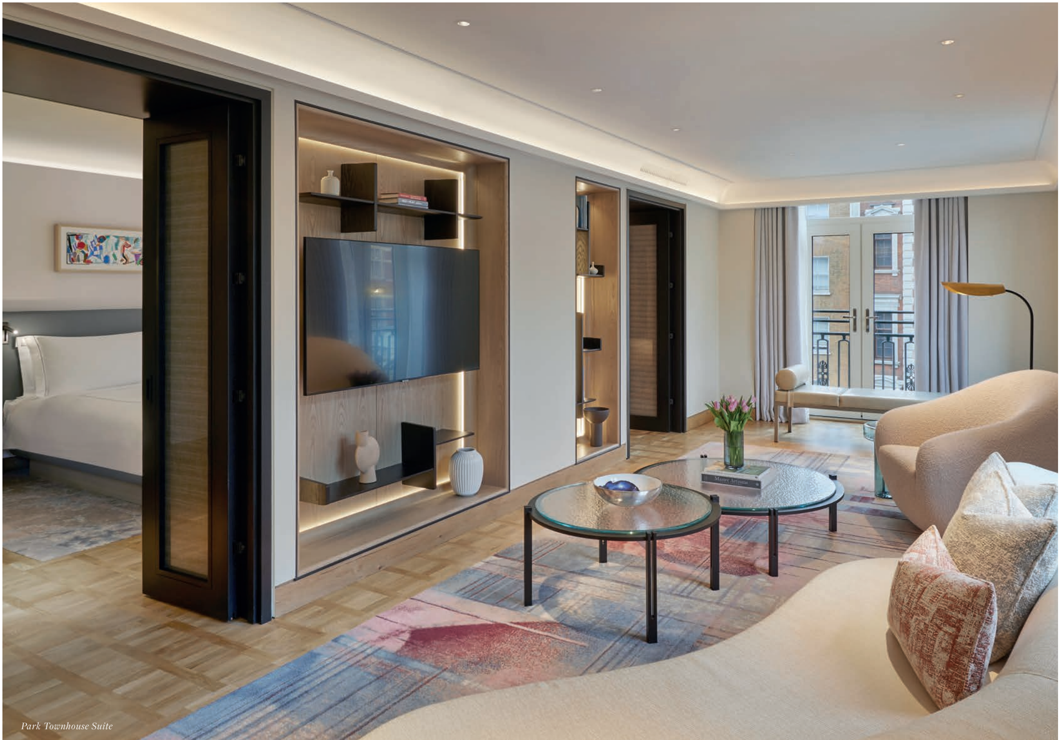
Park Townhouse Suite